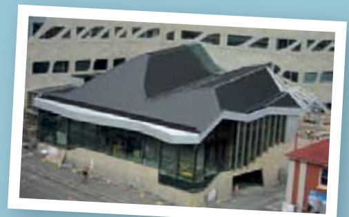
The new lecture theatre (front, middle with black roof) almost complete

Works to refurbish MS1 level three, to accommodate the new Clinical Research Facility that was previously located behind the main reception area on level one, were completed and handed over to Menzies in January 2013. The new space will enable