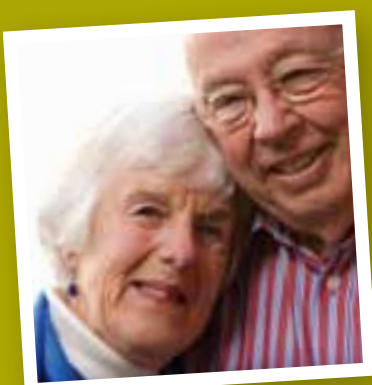
1 in 2 women and 1 in 3 men over 60 years will have an osteoporotic fracture in Australia

Osteoporosis is a common and devastating age-related disease. It is referred to as the 'silent disease' as there are often no symptoms until bones fracture. 1 in 2 women and 1 in 3 men over 60 years will have an osteoporotic fracture in Australia. Fifty per cent of those who fracture their hip after age 80 will die within 12 months after the event.