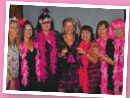
The pink party was a huge success and enjoyed by everyone who attended

"As the evening rolled along, we counted the takings so we could keep our guests informed, and the total kept rising. At 2am I was sitting on my lounge room floor counting the money, which included 600 x $2 coins, with the total at $4,500. I could not believe it. During the next two weeks we continued to receive donations from people who could not attend, or who had just heard about our night and wanted to contribute.