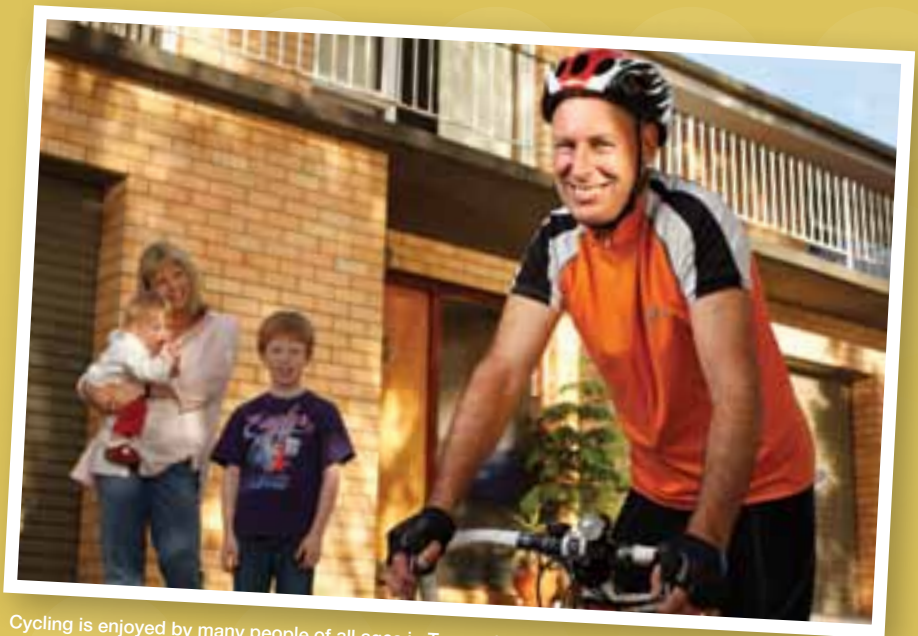
Cycling is enjoyed by many people of all ages in Tasmania

The high costs and severity of claims by cyclists compared to other road users demonstrates the high vulnerability of cyclists, and lends support to increasing separation of cyclists from motor vehicles," says Professor Palmer.