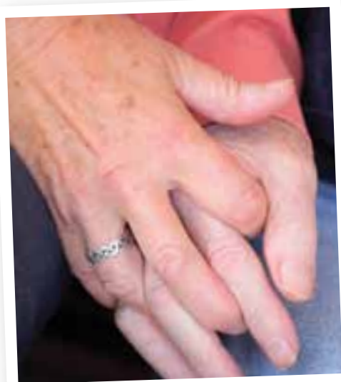
It is predicted nearly one million Australians will suffer dementia by 2050

Alzheimer's disease gradually steals not only your memories but also your quality of life. Anyone that knows someone suffering from the disease will know how heartbreaking it is to watch someone slip into the world of dementia.