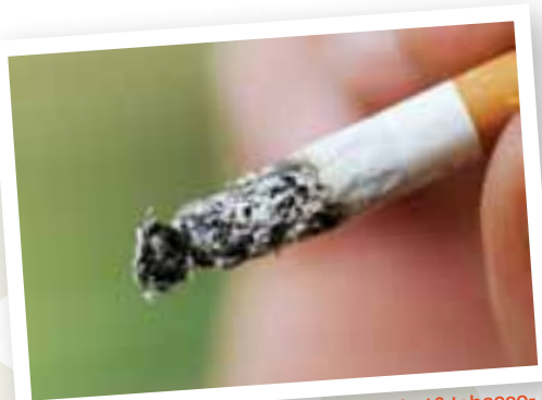
Second-hand smoke accounts for one in 10 tobacco-related deaths (World Health Organisation 2009)

Data collected for the Young Finns Study in Finland and the Childhood Determinants of Adults Health study in Australia was analysed for this study. These two major