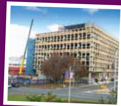
MS2 is now scheduled for completion and occupation by the end of the year

UTAS will lodge the MS2 project details with the Green Building Council of Australia over the coming months for the Green Star assessment process. Green Star evaluates the environmental design and construction of the building. We should know by September if the MS2 building has received the targeted 5-star Green Star rating.