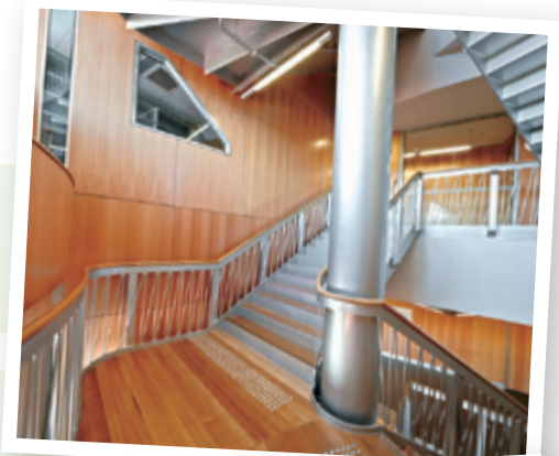
Photo 1 (top): The central stairwell is a main feature of the building

Lyons is now working on the design for Medical Science 2 (MS2), a second stage building adjoining MS1 which will incorporate clinical teaching facilities, specialist laboratories and offices. MS2 is due for completion in late 2012.