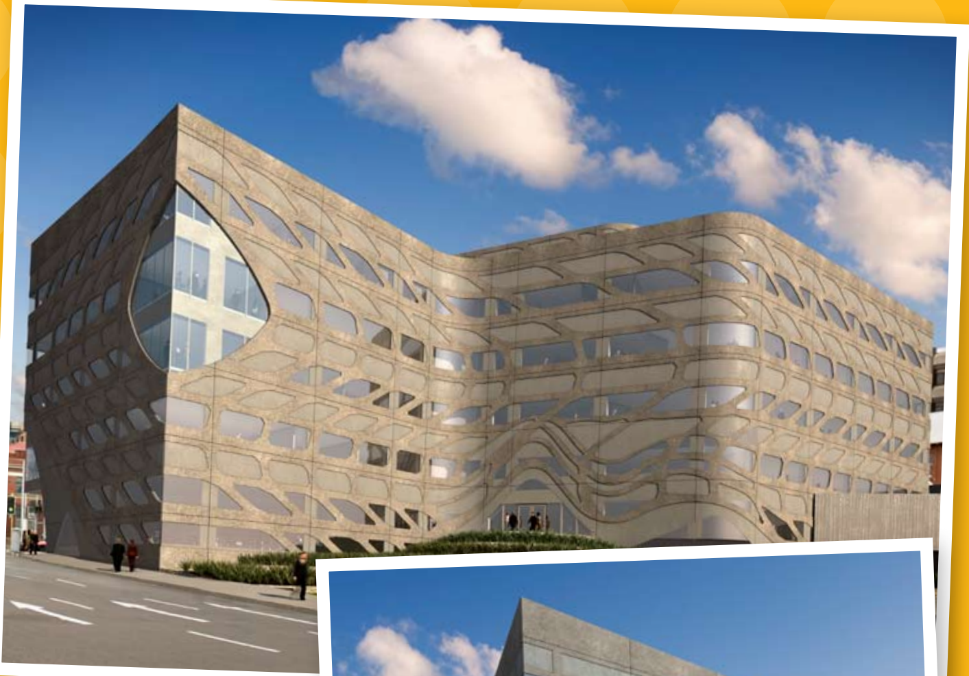
Photomontage of Liverpool St entrance

The new Menzies Research Institute building is continuing to make substantial progress. In the last few months there have been significant changes on the site with all concrete and in-ground works now completed, and lift and stair 'core' structures installed. Many of the precast external facade panels and internal circular columns have been installed. This allows passers-by to gain a good idea of how the iconic facade will look once completed. The panels of the new building are made of exposed aggregate precast concrete in a sandstone colour. Services installation to level one has also commenced.