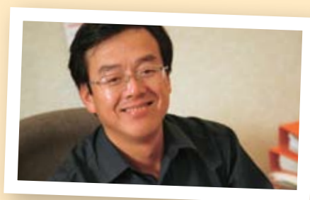
Dr Changhai Ding

We've found that sunlight exposure and vitamin D levels are associated with decreased knee cartilage loss in older