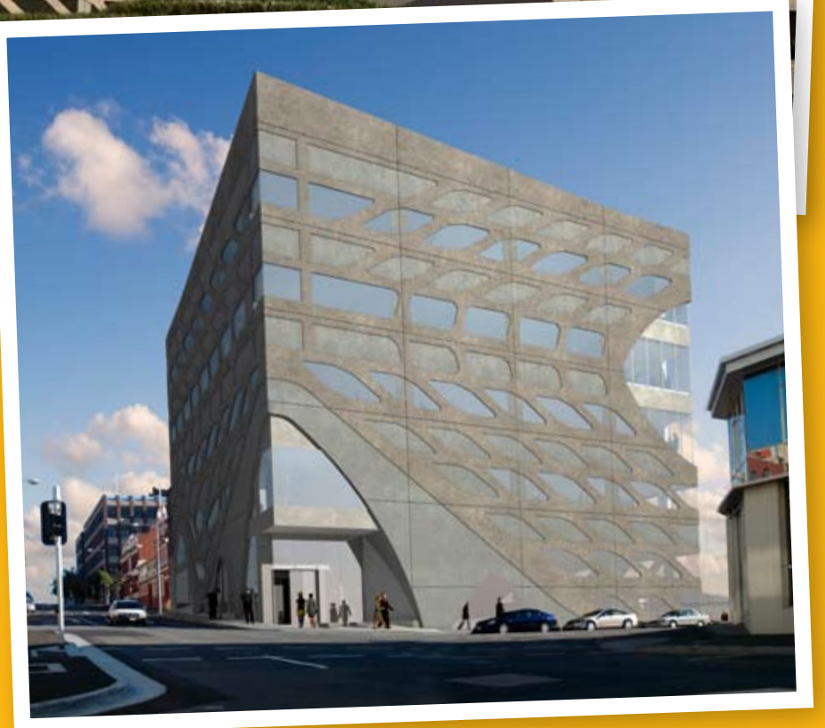
Photomontage, corner of Campbell and Liverpool Streets

A Transitional Planning group - comprising Menzies, School of Medicine and Faculty of Health Science staff - has been formed to plan and prepare for the relocation from existing sites to the new building. A Transitional Project